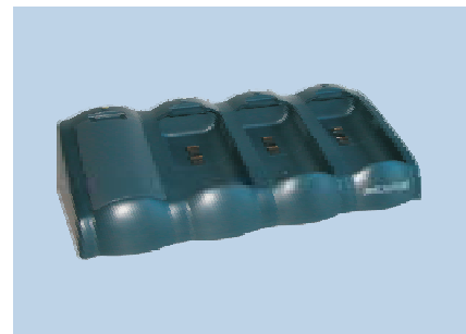
Multiple Battery Charger