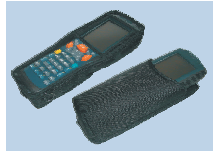
Functional Case and Belt Holster